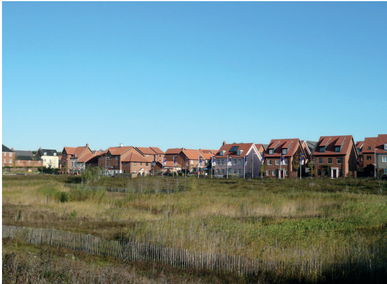
▲ Jasmine Pond