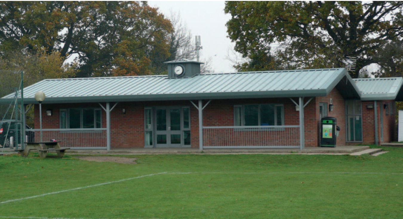
▼ Cringleford Pavilion

New infrastructure will be funded by Section 106 Agreements, Community Infrastructure Levy through the Greater Norwich Development Partnership Local Investment Plan and Programme and the Cringleford Infrastructure Delivery Programme 2013-2026 (see Evidence Base).