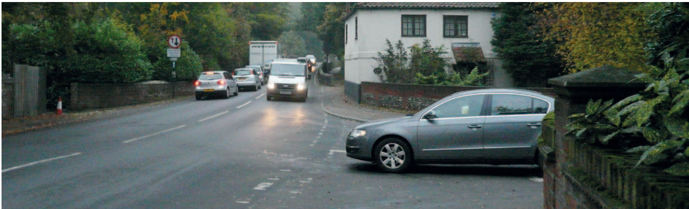
▼ Cringleford Bridge, junction with Intwood Road

Consideration should be given to connecting the Bus Rapid Transit system to the employment hub consisting of the Norfolk and Norwich University Hospital, the University of East Anglia and the Norwich Research Park. Possibilities include use of the park-and-ride facilities at Thickthorn or the provision of an interchange at the intersection of Round House Way with the A11.