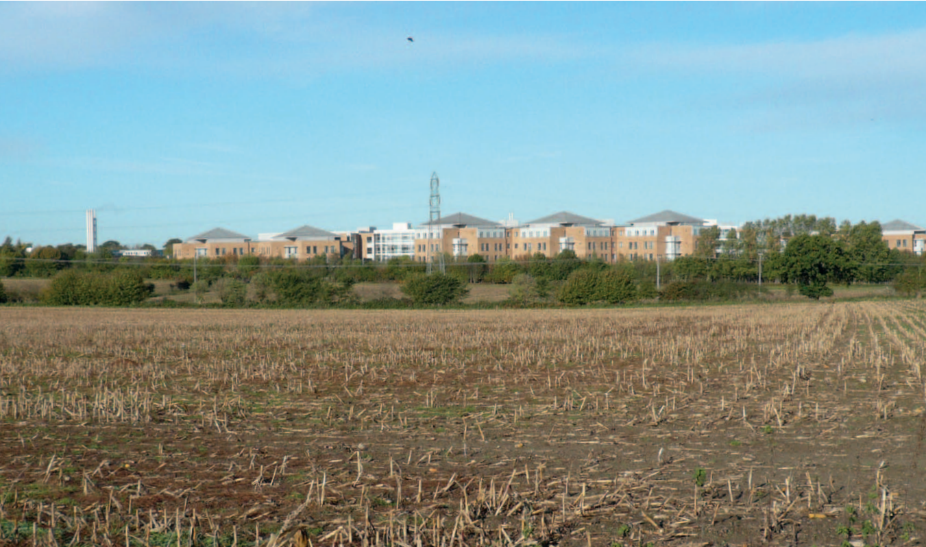
▼ Newfound Farm, looking towards the hospital

The sub-division of existing large gardens in the village (i.e. ‘backland’ development) will be discouraged and will be permitted only when it can be demonstrated there would be no unacceptable impacts on flora and fauna and it can be demonstrated that the character of the surrounding neighbourhood (in terms of the appearance and massing of development) is maintained.