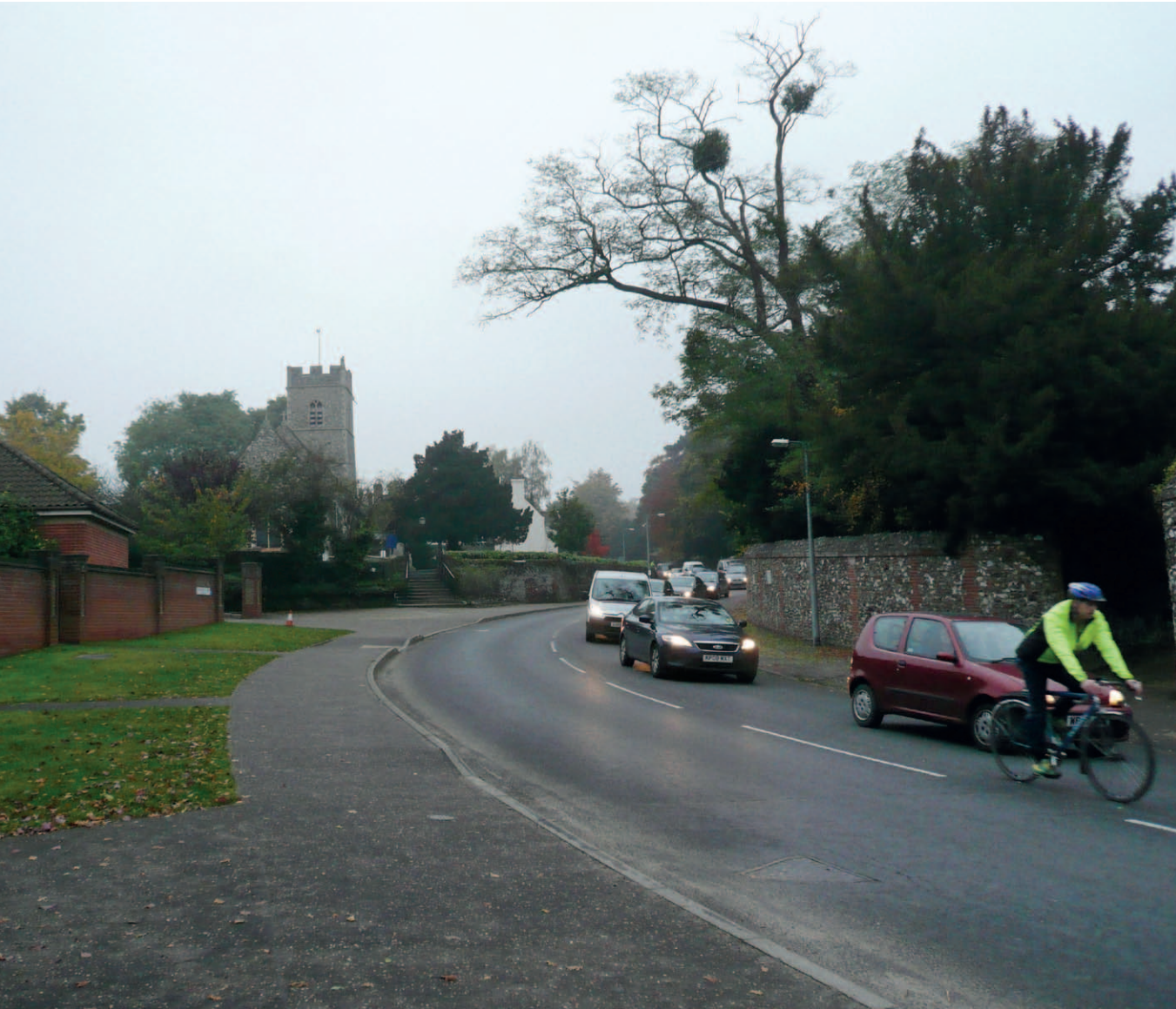
▼ Newmarket Road, morning rush hour

A complete Sustainability Appraisal has been carried out on the Plan by the Parish Council using a matrix to compare policies against objectives. The results are set out in the Evidence Base. The relevant Strategic Environmental Assessment is contained in the Greater Norwich Development Partnership’s Joint Core Strategy (Environmental Statement March 2011).