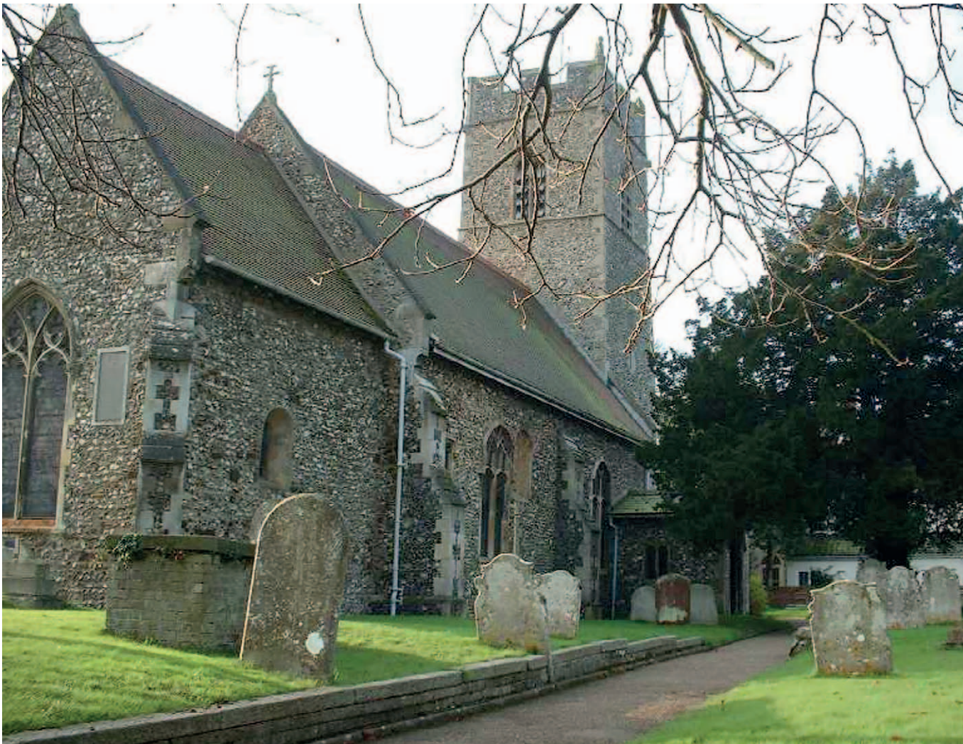
▲ St Peter's Church, Cringleford

Space should be set aside for provision of allotments and a community orchard in allocated development areas to meet the expressed local need. A possible site is indicated on the Proposals Map.