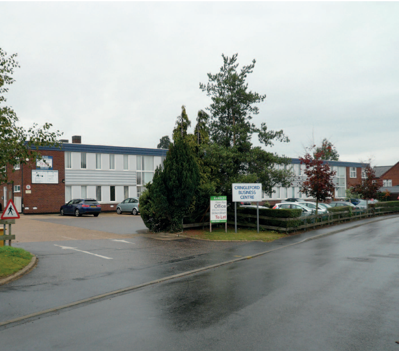
▼ Cringleford Business Centre

Applications for new employment-generating development must include adequate provision for vehicle and cycle parking, vehicle turning and servicing in accordance with Parking Standards for Norfolk 2007 .