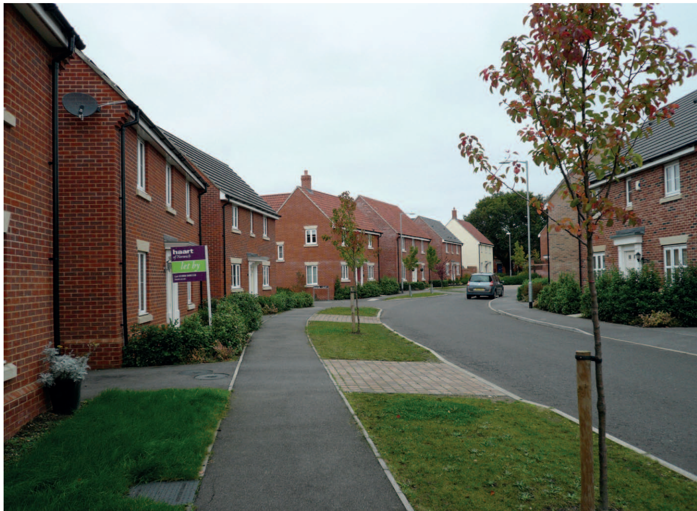
▼ Kingfisher Close