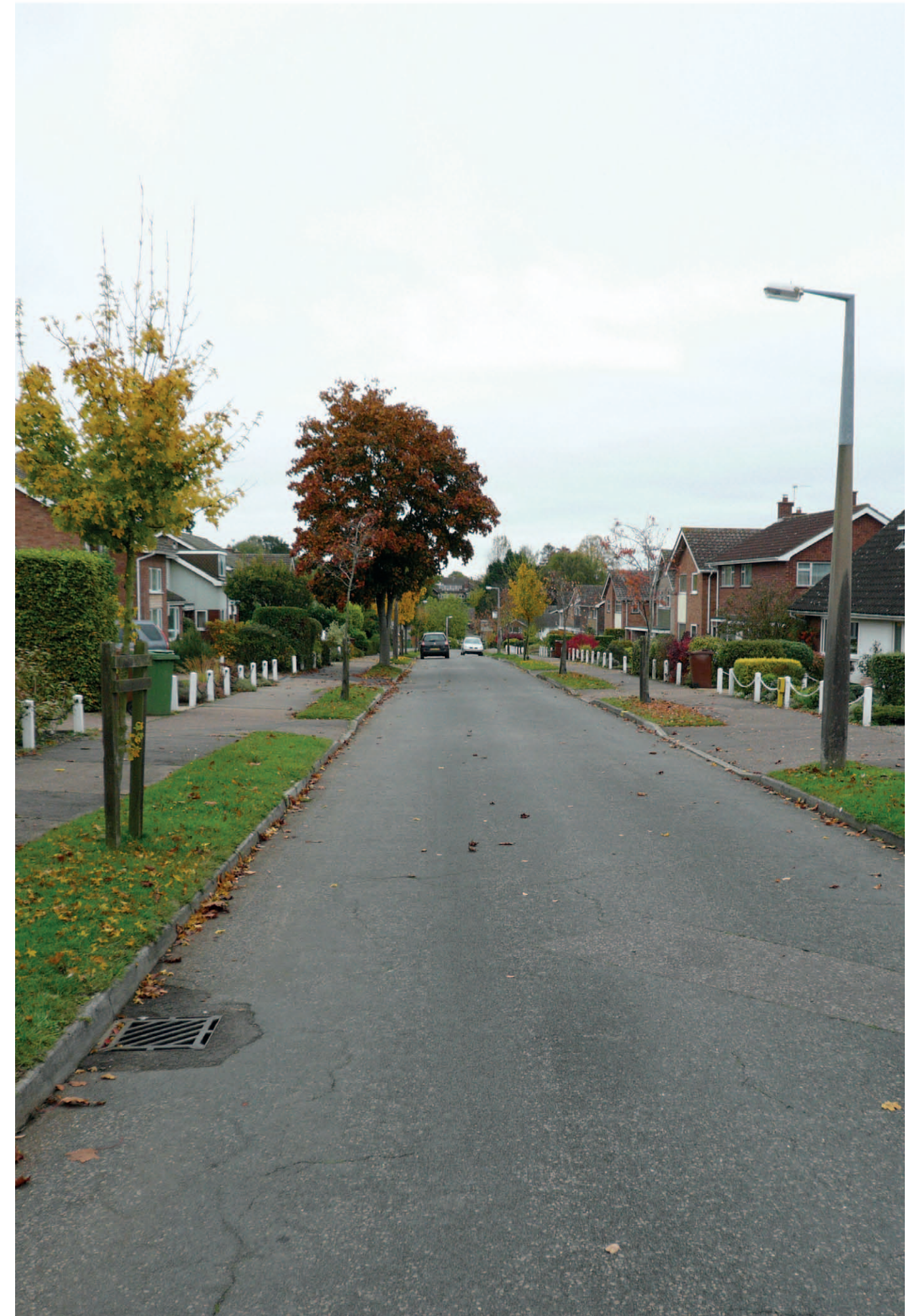
▼ Brettingham Avenue

Heritage assets within the parish, especially the listed buildings in the Conservation Area, and their settings must be protected, conserved and enhanced when development proposals are brought forward.