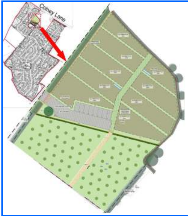
Location (inset) and proposed layout of Newfound Orchard and Allotments at Cringleford Heights (modified with permission from BDWH). Trees will be planted using a 5m hexagonal pattern allowing space for people to sit and picnic beneath them.

‘new-found’ band of clay was discovered there. The land was sold by the Great Hospital to John Balleston. Because of its quality, much of the clay was exported to Holland as ‘Balleston Newfound’. The clay was used locally for making pottery, brick and tiles for many years, probably into the 18th century when the site was turned over to farming. Archaeological investigations undertaken as part of the current development of the site uncovered one old 16th/17th century kiln close to our planned orchard and allotments. From the debris found associated with it, the kiln in the photograph was believed to be for the production of bricks and tiles.