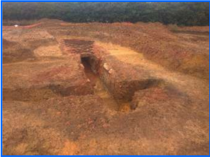
The entrance to a brick kiln (at the top end of the trench) uncovered prior to the start of building at Newfound Farm.

names and fruit trees, and the history of the site will be placed on our website and linked to the area via QR codes on plaques by the site. The allotments will become available then and, If you are interested in renting one, please send an expression of interest to admin@cringlefordpc.org.uk .