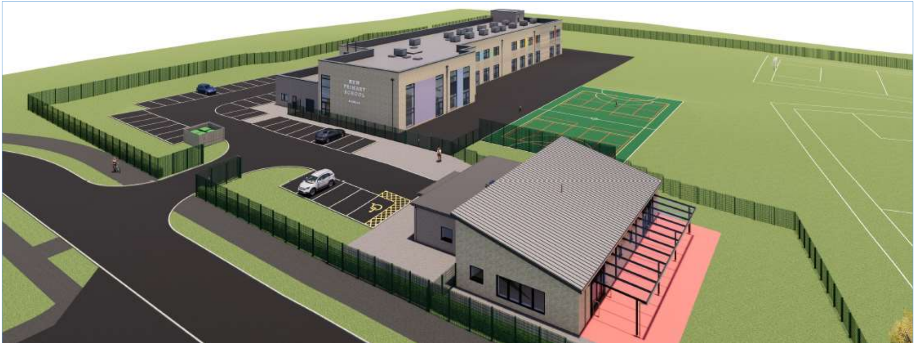
3D artist's impression of new school building (looking north).