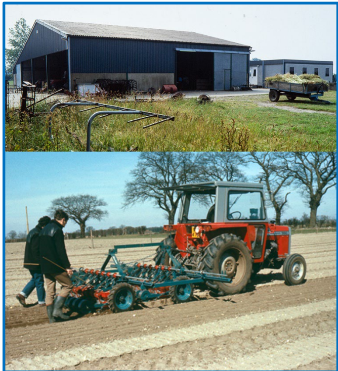
Top - Newfound farm buildings; bottom - preparing land at the Farm for pea variety trials, circa 1975.

named Cringleford Heights. The farmland to the south of Cringleford Heights remains with the John Innes Foundation and is farmed by Morley. It is anticipated, however, that the southern parcel will also be turned over to housing in the near future.