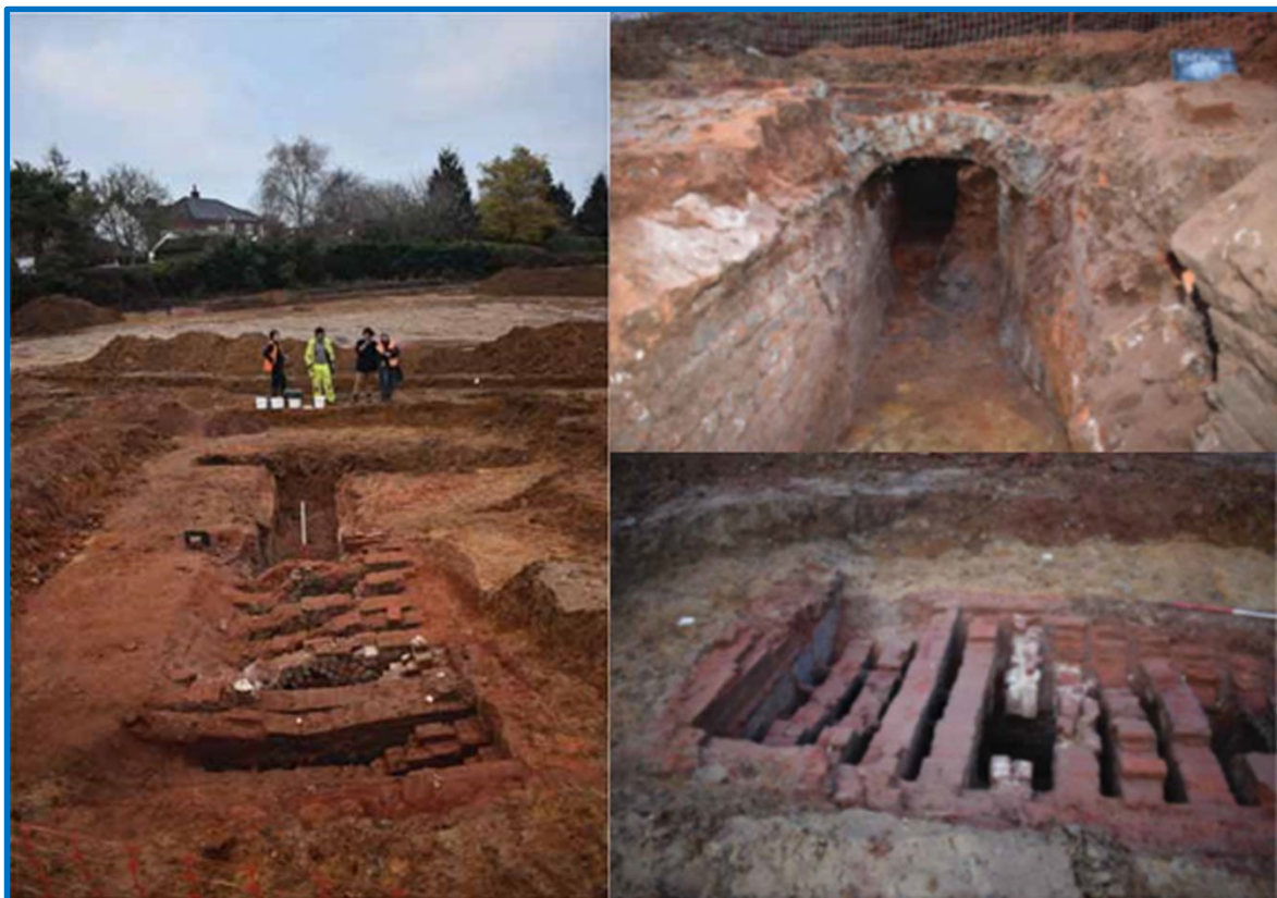
Kiln 21, Newfound: left – looking east with Newfound Farmhouse in background; top – detail of the arches looking west; bottom – west end looking north (from Clarke and Collie, 2022)

of which, a 16th/17th century kiln, found under our orchard and allotments was the most intact. Debris from the site included pottery (vessels, plates and bowls), bricks and tiles.