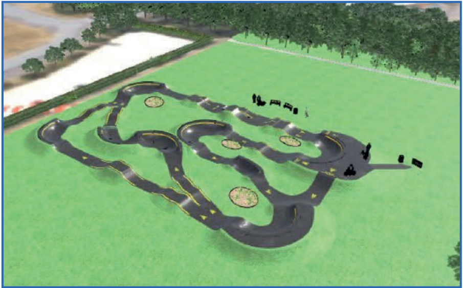
Designer's visualisation of one potential pump track option