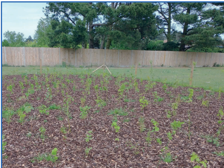
A Miyawaki mini forest shortly after planting

What are mini forests, you may well ask. Miyawaki forests are an innovative approach to encouraging wildlife to thrive in populated areas. The approach was developed by Japanese botanist Dr Akira Miyawaki. Each forest is normally about a tennis court size, but can be smaller as in our case. It involves the dense planting of lots of different native species using intensive cultivation for the first few years. The aim is to create an ecosystem rich in biodiversity where plants, birds, insects and other species can live and