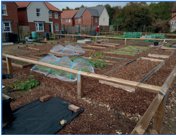
Views of Newfound allotments on Cringleford Heights last month