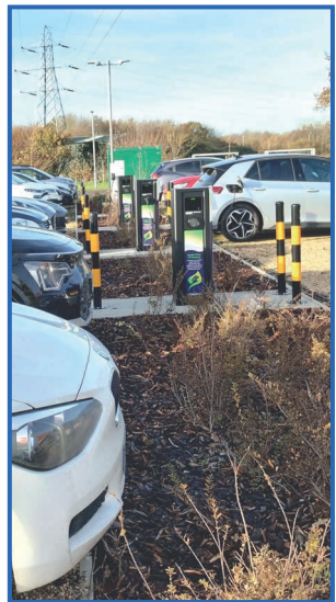
Car charging points at TJC. There are six 22kW and two 50kW chargers

Sad to see. We are disappointed to report that we have seen a number of items being damaged around Cringleford over the last few months including a bin at the end of Colney Lane that was set alight, graffiti in various places including across road markings, and damage to one of our new woodland animal carvings. All such incidents are reported to the police. We have also noted that the zip wire seat in the play area by TWC has been mauled yet again by a dog. The seat costs at least £500 to replace, so we ask all dog owners to please keep their dogs under control. Please may we remind owners that dogs are not allowed in the children's play areas. We would also ask everyone to be vigilant and report damage to our Clerk ( clerk@cringlefordpc.org.uk ) or anti-social behaviour to the police .