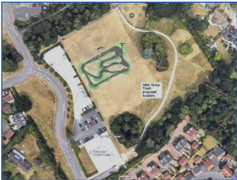
Proposed location of pump track on TWC's playing field