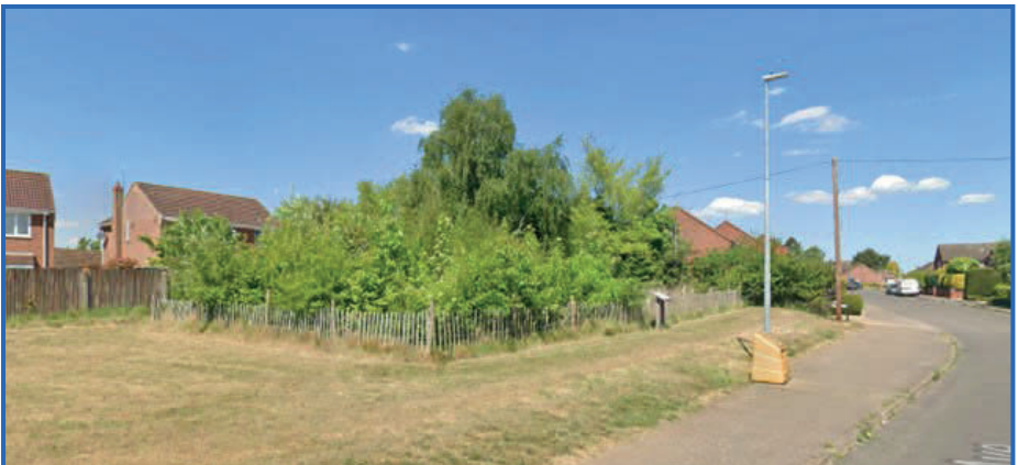
The mini forest at Warren Avenue, Fakenham in May 2025 after 3 years

We are working with The Conservation Volunteers on the projects, but we would welcome offers of help with the planting from the community for both these projects. If you feel you or your family would like to help, please get in touch with our Clerk by the middle of November ( clerk@cringlefordpc.org.uk ).